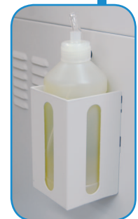
Optional EvenFlow™ Automatic Oiling System

Formax - New Hampshire, USA www.formax.com