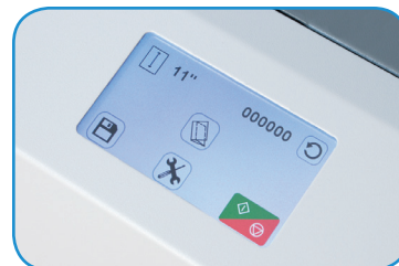
Touchscreen control panel is graphics-based making it easy to use