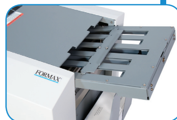
Automatically adjusting fold plates make for quick and easy setup